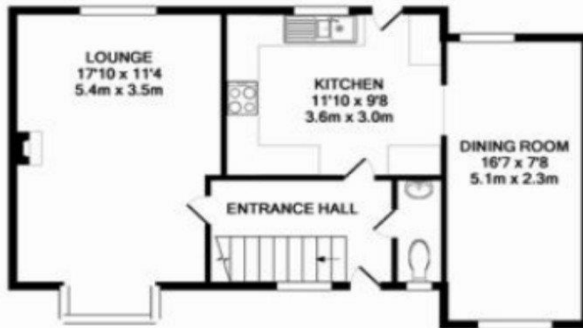
GROUND FLOOR APPROX. FLOOR AREA 506 SQ. FT. (47.0 SQ.M.)